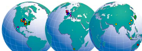
Worldwide Manufacturing Facilities

Donaldson Torit has a strong global presence throughout the world with numerous manufacturing plants dedicated to dust collection. In the U.S., Donaldson Company has more than 30 local direct field sales employees and several dealers, application engineers, certified service centers, and OEM and New Business Development account managers, prepared to serve your dust collection needs.