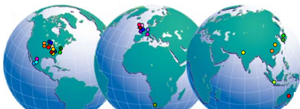
Worldwide Manufacturing Facilities

Donaldson Torit has a strong global presence throughout the world with numerous manufacturing plants dedicated to dust collection. In the U.S., Donaldson Company has more than 30 local direct field sales employees and several dealers, application engineers, certified service centers, and OEM and New Business Development account managers, prepared to serve your dust collection needs.