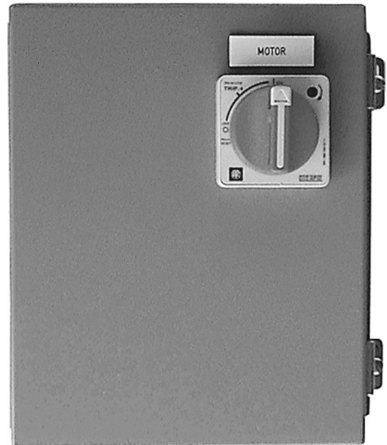
Manual Motor Starter

Provides on/off control for blower motors used as part of a dust collector, protecting the motor from short circuits and running overloads.