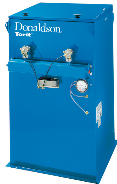
TBV-4 with Plenum

Designed for easy filter service and maintenance—no tools required