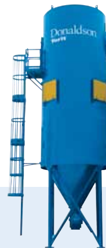
RF and LP Baghouse Collectors