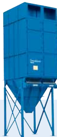
Dalamatic® Cased Baghouse Collectors