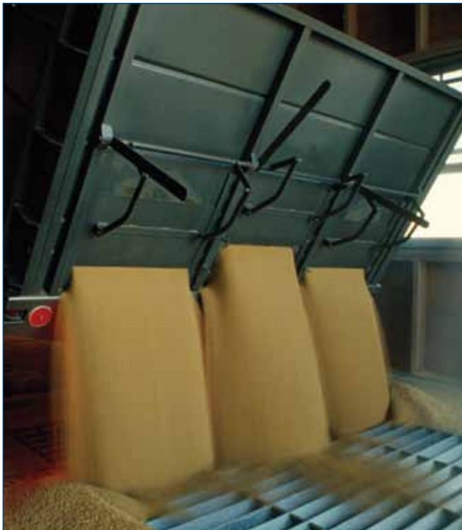
Above: Dumping soybeans generates 10,000 pounds of dust every 36 hours at this midwest terminal.

SOLUTION: By switching from conventional 16-oz polyester filter bags to Donaldson® Torit® Dura-Life™ bag filters, this soybean terminal now enjoys more than 3 times longer filter life.