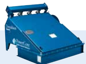
Torit® PowerCore® Bin Vent Collector