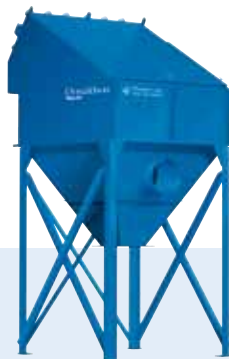
Torit® PowerCore® Dust Collector