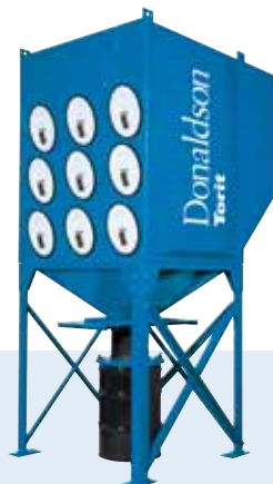
Downflo® Oval Dust Collector