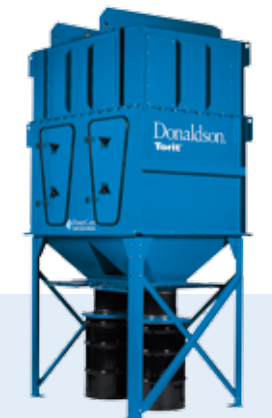
Torit® PowerCore® VH Series Dust Collector