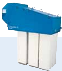
Dalamatic® Insertable Dust Collector